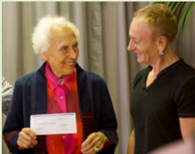
Phil Collen of Def Leppard presents donation